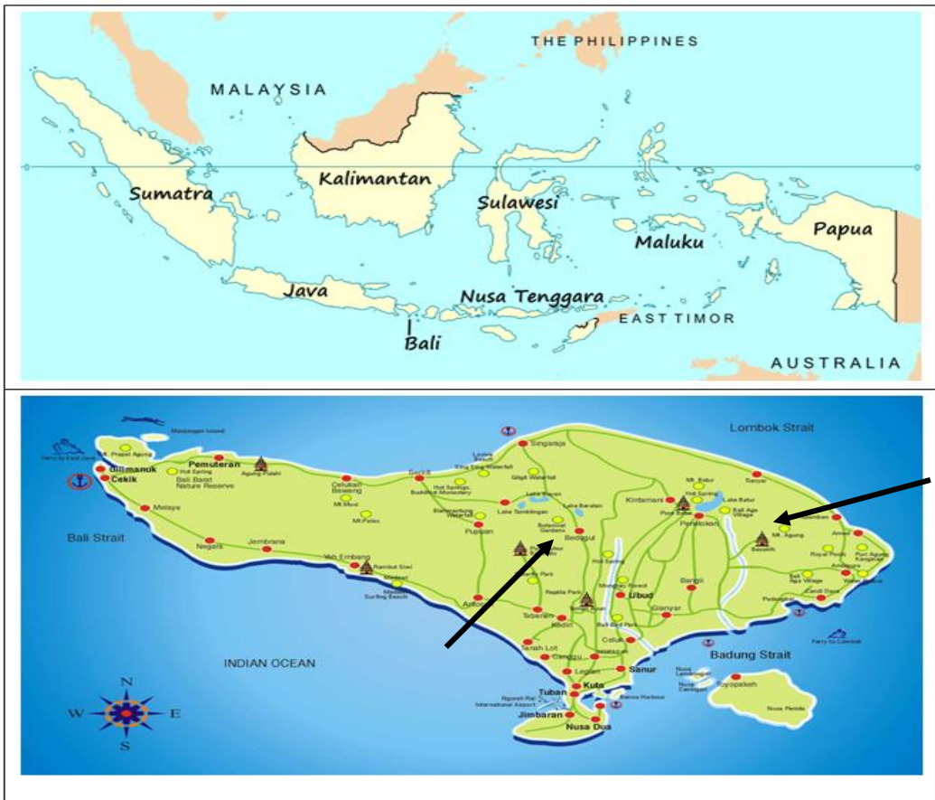
Figure 2: Site map

Primary and secondary data were collected in the study by using various techniques, such as survey, interview, direct observation and documentation. In order to have deep information, the technique of Focus Group Discussion (FGD) was also employed by inviting the key informants of farmers groups, market actors (local traders, exporters, officers of local governments, officers of local banks, and staff of research institution). In this study, data were analyzed by using descriptive method.